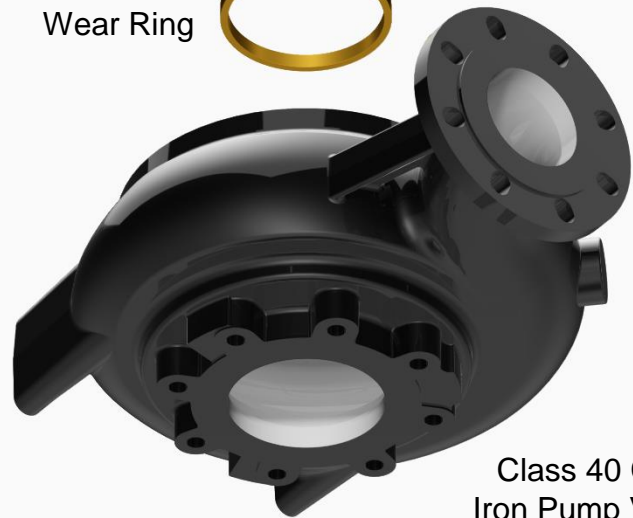
Class 40 Cast Iron Pump Volute